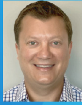
Dr. Michael D. Dambeck Physiatry Program