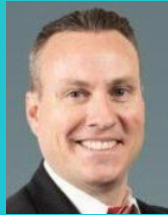
Dr. James Cosentino Pulmonary Program